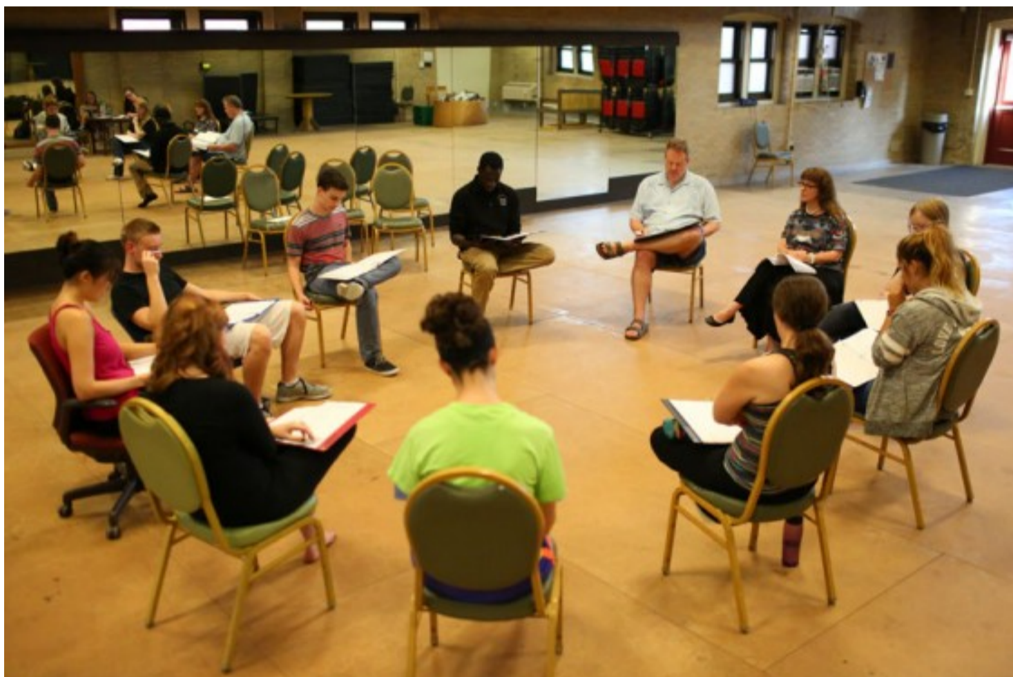
The director, playwright and actors group together to discuss their characters.