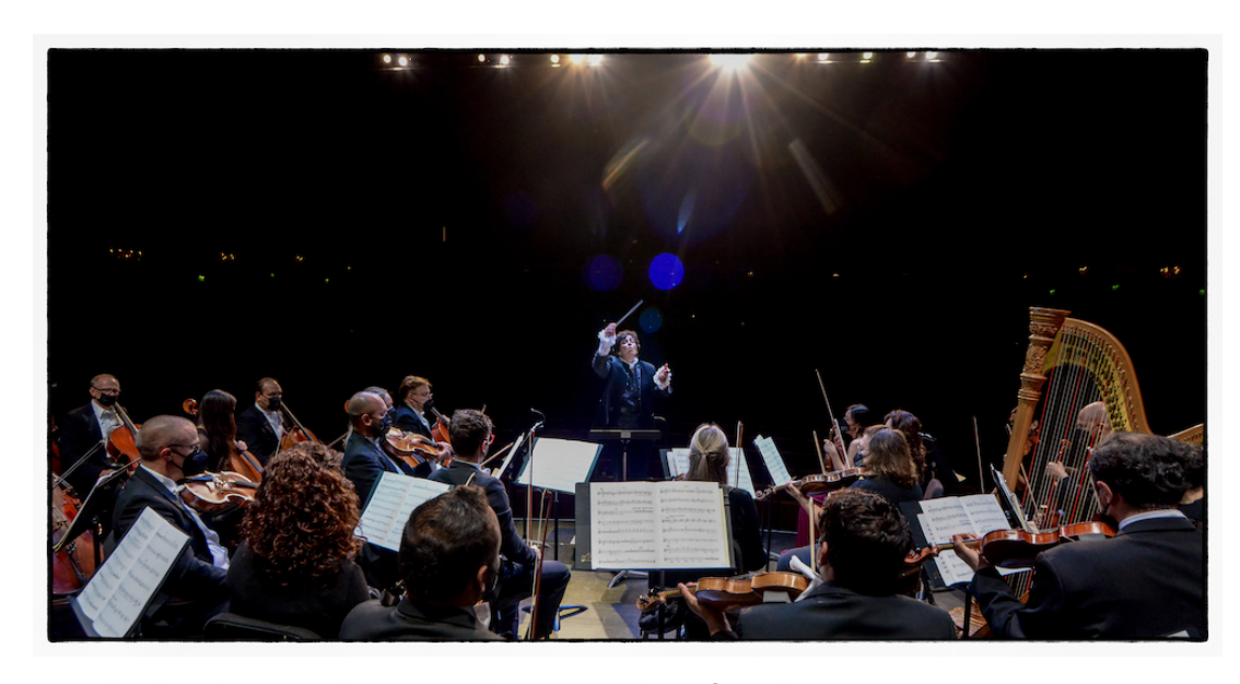
South Florida Symphony Orchestra Kicks of 25th Anniversary Season at New World Center