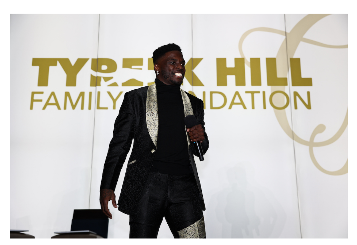
The Tyreek Hill Family Foundation Gala