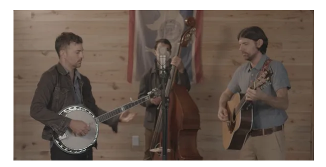
WATCH: The Avett Brothers Release Title Song From SWEPT AWAY